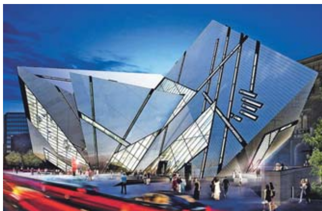
The Lee-Chin Crystal at the Royal Ontario Museum, above in an architect's drawing, will be unveiled as part of Luminato.

On June 2 and 3 the Muhtadi International Drumming Festival will include performances from musicians representing tons of cultures, from noon to 8 p.m. both nights at Queen's Park. On the last weekend of Lum-