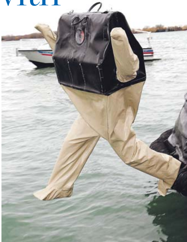
Matt Hunter , co-host of History Television's The Re-Inventors , demos a re-creation of a flotation suitcase that was designed to save people during a shipwreck. The suit unfolds from the case.

Some other cool inventions were the Rush to Brush. It was a toothpaste holder that sticks on the wall and to use it you just push back on the holder and toothpaste will come out. There was also an alarm clock that hits