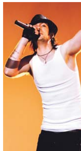
Adam Gontier fronts Three Days Grace at this year's Junos.